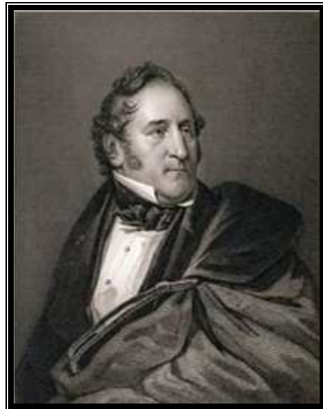
Thomas Hart Benton